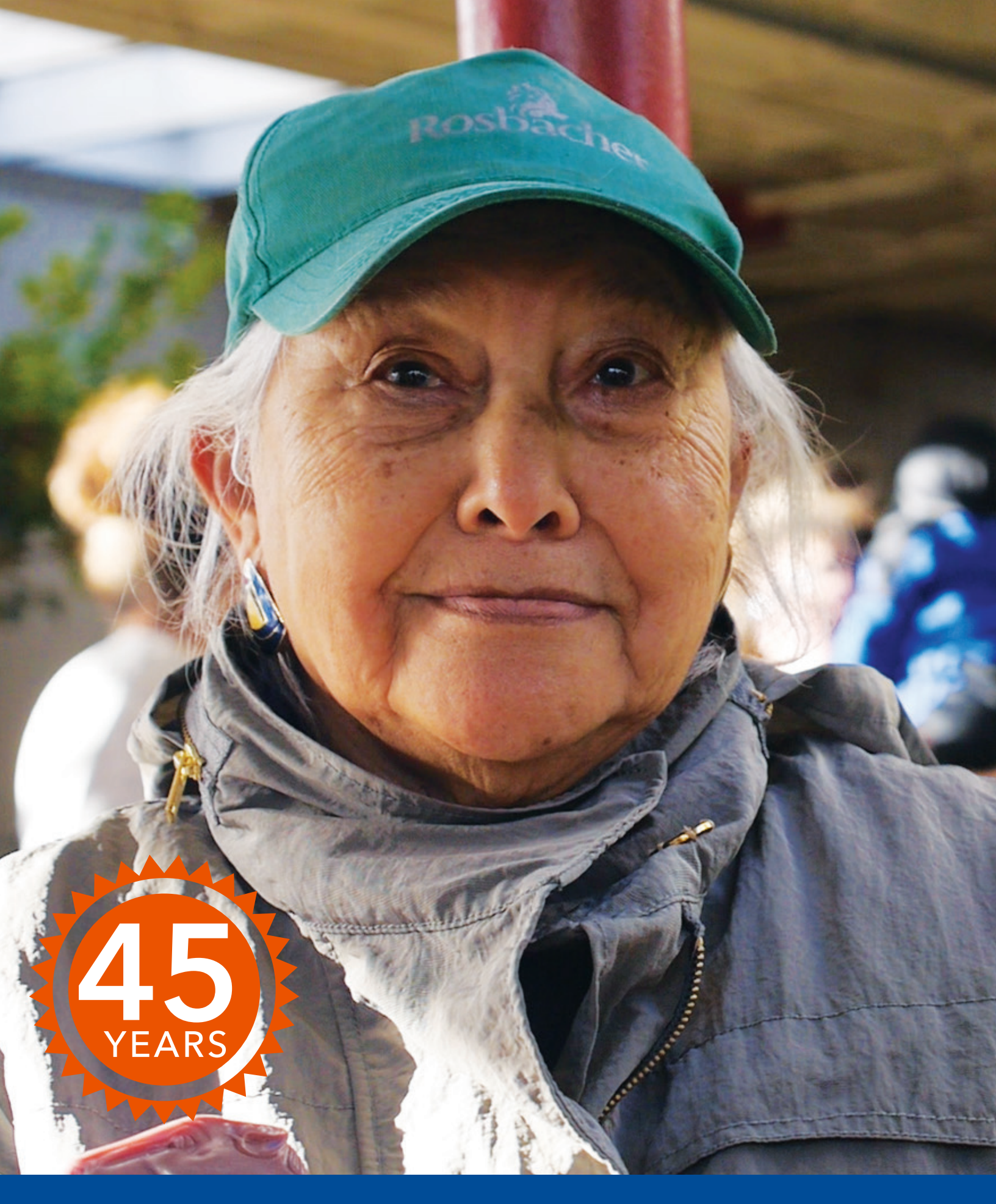
Samaritan House Annual Report 2019