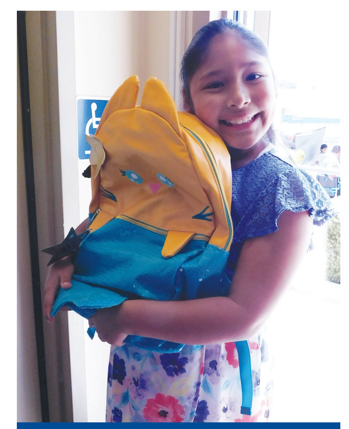
Children receive new backpacks at the East Palo Alto distribution!